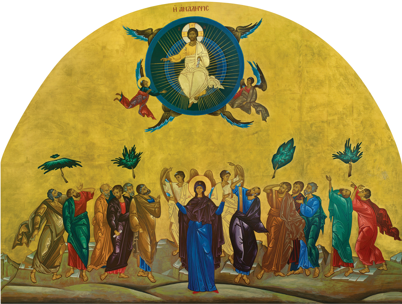
ICON OF THE ASCENSION