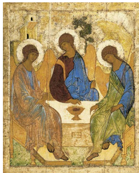
Rublev's icon of the Trinity invites the observer to sit at the table as the 'fourth person'; part of God's active presence in the world today.

'The more we come to know God, the more we come to know the deepest meaning of our lives. We grow in the knowledge that we are part of God's project for the world.' (WFTR, 60)