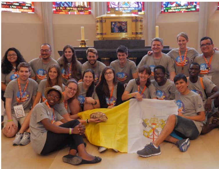
MYM Pilgrims at the International Meeting of Marist Youth - Dare to Dream

A special thanks goes to the Marist Association for all their support, guidance and prayers during this time.